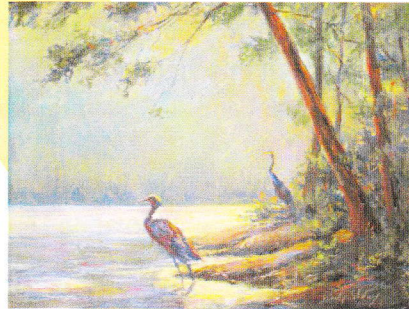
Early Morning Fishing By Wendy Soliday