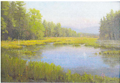
Sucker Brook